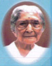
Padmashri Dr. Chitra Naik